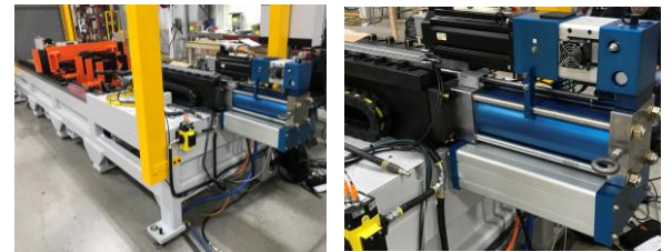
Kyntronics SHA – Installed on the Horizontal Assembly Press Station

The Kyntronics SHAs implemented on the new horizontal press stations exceeded the requirements of the machine builder and end customer including the following highlights: